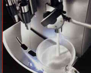
Professional Cappuccino Frother for trendy specialities