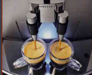
Perfect coffee quality and a fabulous crema