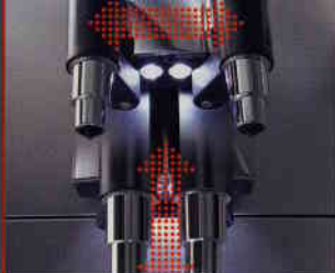
Height- and width-adjustable coffee spout