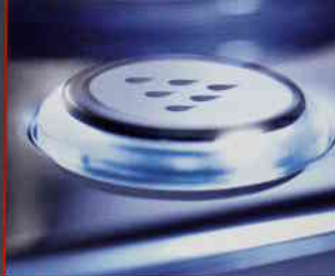
Rinsing, cleaning and descaling program