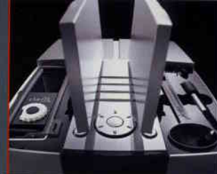
Practical storage compartment for accessories