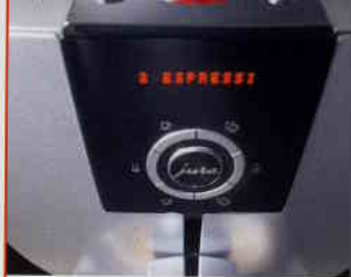
Intuitive operation with Rotary Switch and display